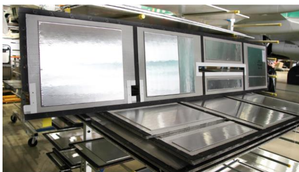
Panel kit equipped ready to install.

Eric Cagnat, Chief Operating Officer at JCB Aero, praises their successful collaboration: "The team at SHD were easy to work with and provided a tailored solution at an attractive price. As the FRVC411 is a versatile resin system, it helped to reduce processing times whilst maintaining our high-quality requirements. Overall, we were very impressed with the product and will return for future projects."